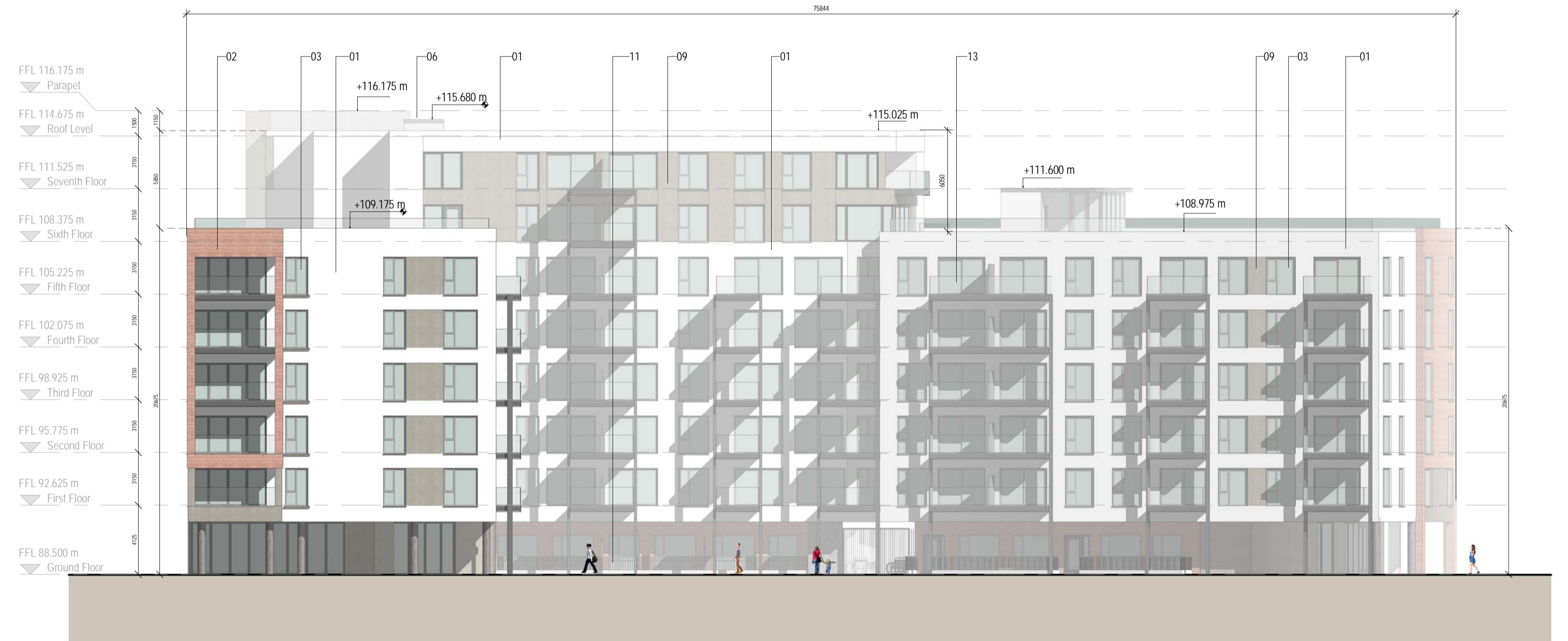
03 - West Elevation 1:200

Note: All dimensions to be read in conjunction with dimension shown on GA plans.