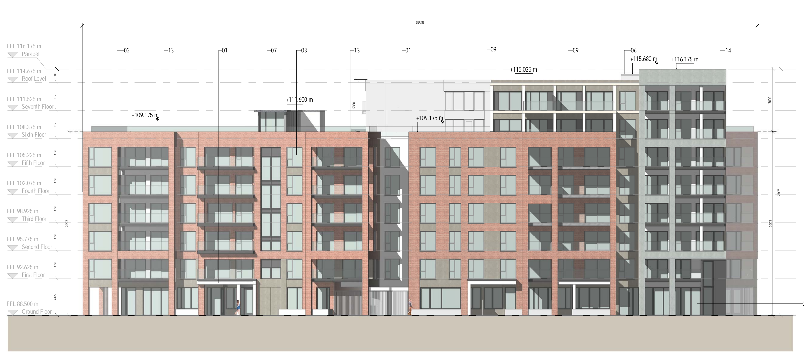
01 - East Elevation 1:200