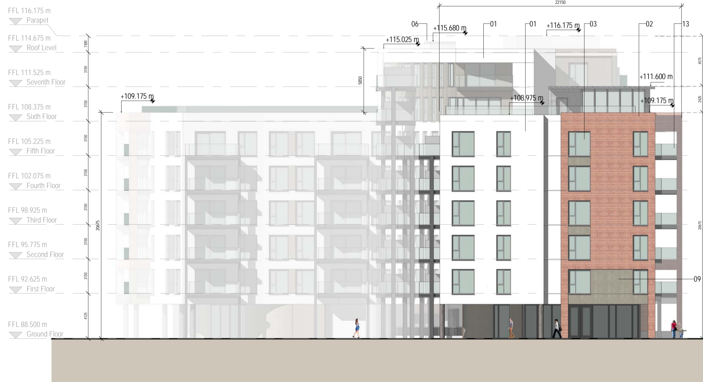
04 - South Elevation 1:200