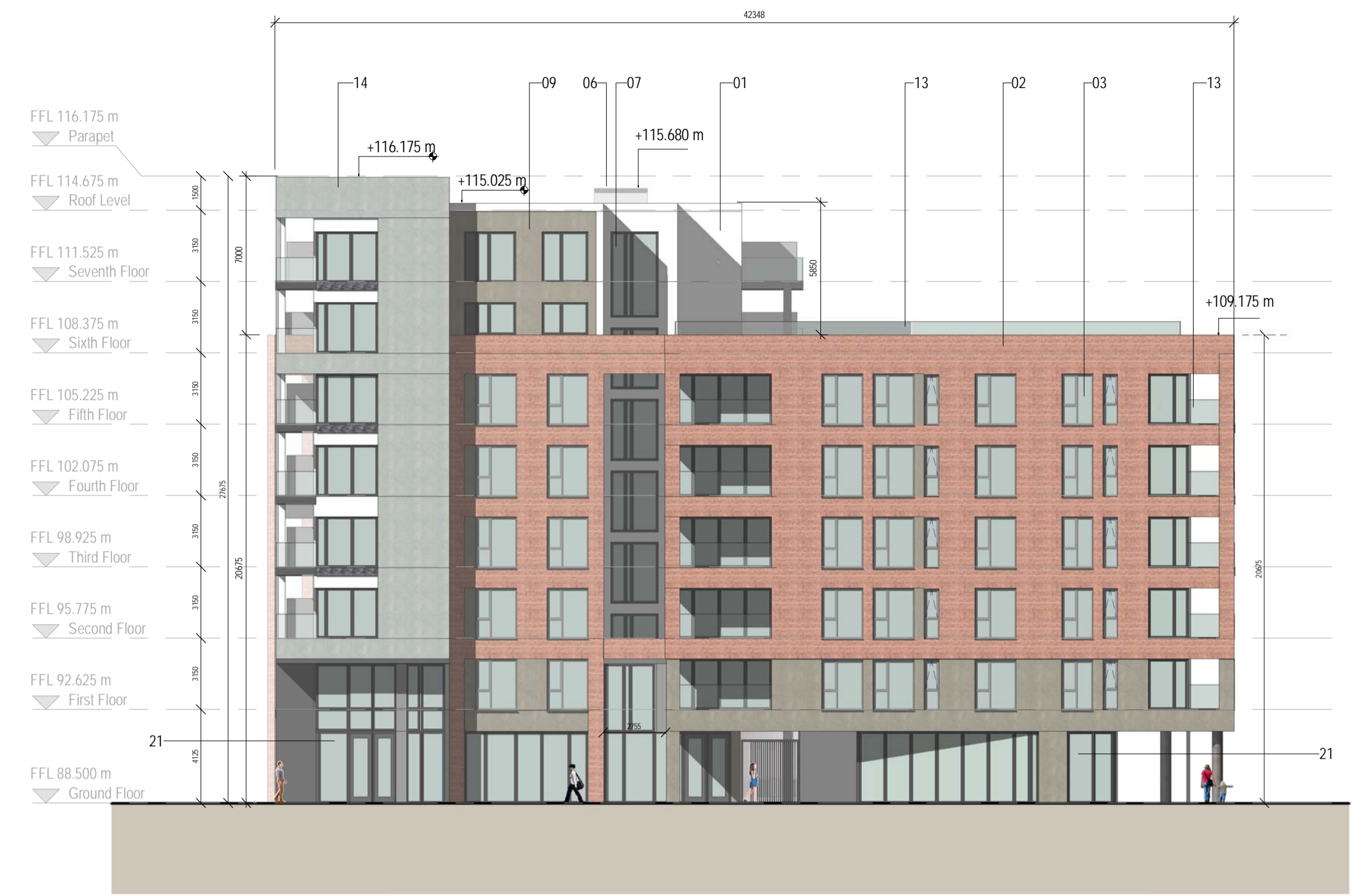
02 - North Elevation 1:200