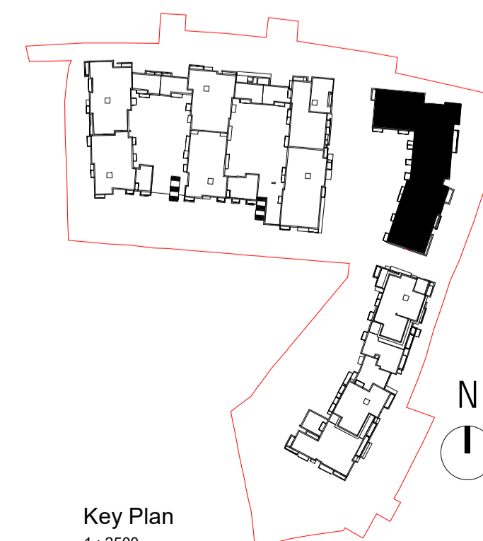
Key Plan 1:2500